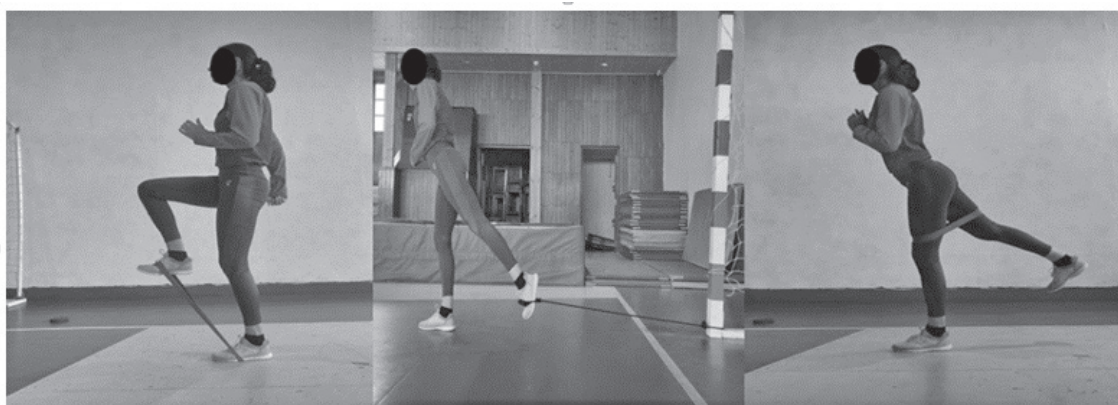
FIGURE 1. Demonstration of exercises performed by the ERB group

namic stretches of 8 repetitions each: knee to chest hugs, butt kicks, lateral lunges, forward deep lunges, and squats, with 3 repetitions of 10-meter sprints. After the general warm-ups and before commencing the specific warm-up, Pre-testing of CMJ was done. After 2-minutes of Pre-testing, athletes went for specific warm-up exercises, 5-7 repetitions each, including High-knee marching, A-skips, straight lead leg-skips, split lunges jump, one leg complete cycle (both legs), single-leg swing and cycle (both legs), piston action, and ABC drills. The ERB group performed the exercises/drills using spiral elastic resistance bands circumscribed on thighs and knees while performing the drills, whereas, in the case of single leg movements, the resistance bands were hooked to the stationary points to perform the exercises, as shown in Figure 1. The colour determined the intensity of resistance bands: yellow, green, red, blue, and black. All the athletes used blue-coloured resistance bands. This induced approximately 12-14 kg of force upon 100% elongation (as per the manual GoFit Pro Power), ensuring an ERB load of at least 10% of body weight (Burkett, Phillips, & Ziuraitis, 2005; Lum & Chen, 2020; Mina et al., 2019).