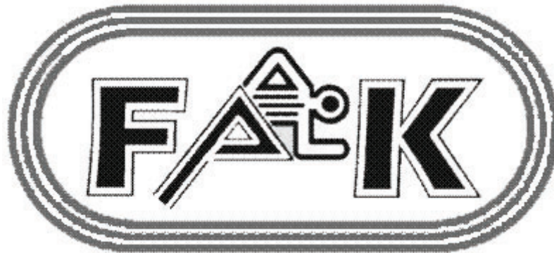
Figure 1. Symbol of the athletic federation of Kosovo

ciation of Athletic Federations (ABAF), whose work orients it on the basis of respecting the rules and regulations of these associations. The Athletic Federation of Kosovo functions as a non-profit and non-political organization. Kosovo Athletics Federation's seat is in Prishtina. The symbol of the Kosovo Athletic Federation consists of an ellipse ring (red) symbolizing the path of athletics and abbreviation of the federation - FAK of black and white, where letter a itself contains the symbol of the runner (Figure 1).